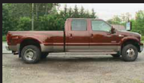
This truck was featured in the ABC News story investigating the fraudulent sale of a Hurricane Sandy flood loss vehicle.

NSVRP also cautions that a majority of the vehicles involved in natural disasters are not covered by property/casualty insurance either due to the age of the vehicle, or as a result of being part of a self-insured fleet, or just as a result of a lack of such coverage based upon cost considerations. As a result, those flood loss cars would not be reported into VINCheck, even if all participating insurers fully reported into the system.