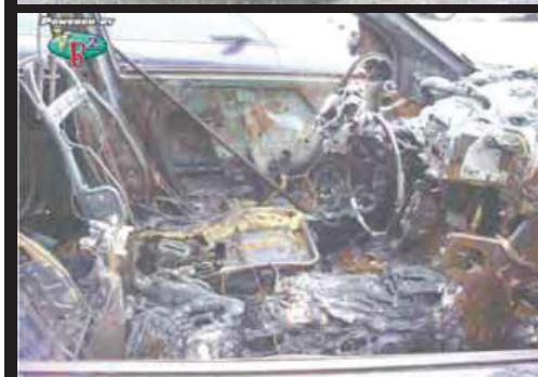
The insurer underestimated the damage of this obviously unrepairable 2004 Honda Pilot to avoid a non-repairable title designation. Today, a vehicle with the same VIN is registered in Michigan. It appears the original burnt-out but under-branded Pilot was purchased for the paperwork by what is now known to be an international organized crime group.